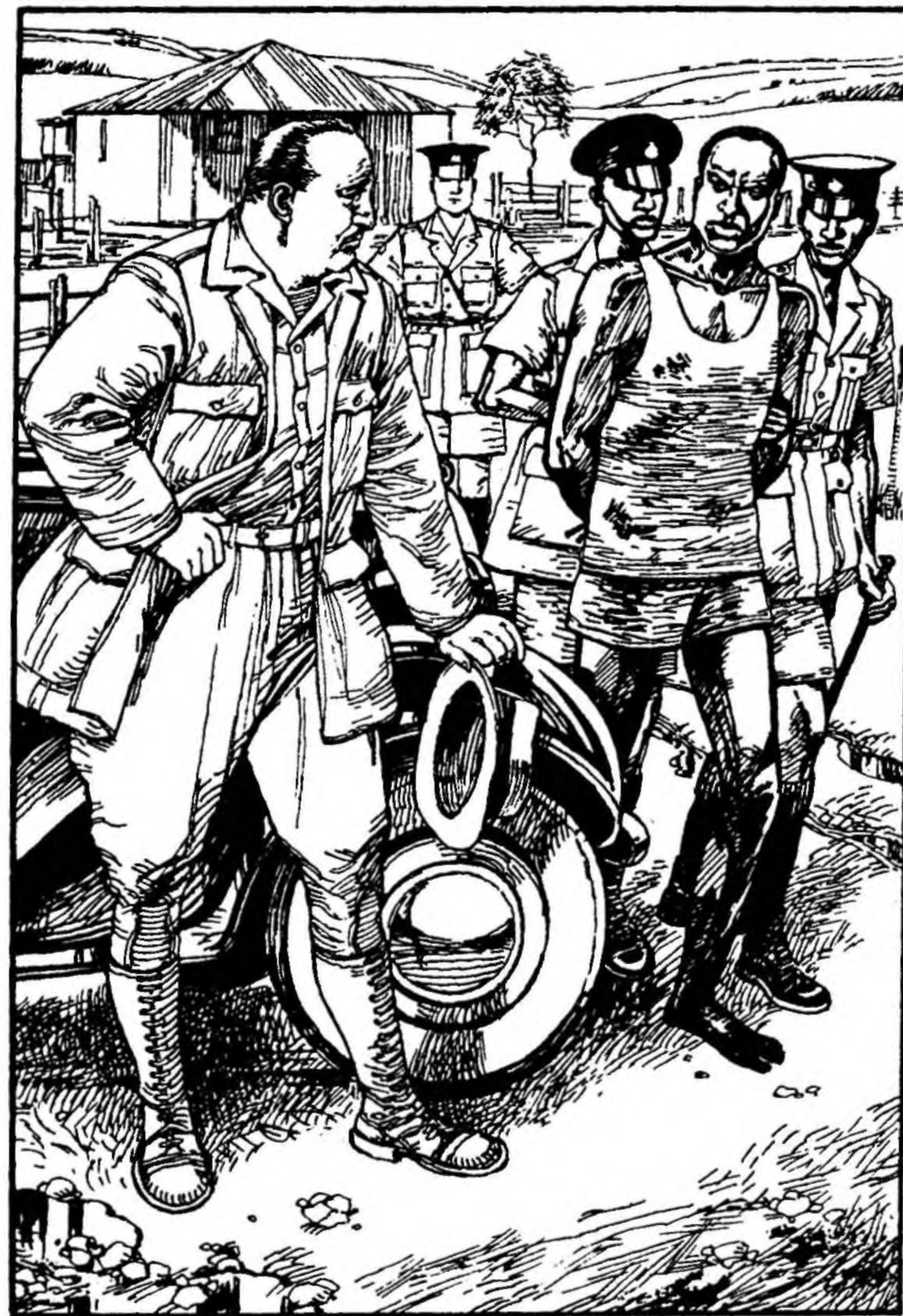
Charlie walked towards Moses and looked directly into his face. The man looked back without expression. For a moment Charlie's face showed fear.

Charlie examined the young man. Another soft boy with a private education who had come to Africa to learn to be a farmer. They were all so similar. They usually came with ideas of equality, and were often shocked at first by the way whites behaved towards the natives. A few months later these young men had become stronger and harder and learnt to accept the way things were. If Tony Marston had spent a few more months in the country it would have been easy. That was Charlie's feeling.