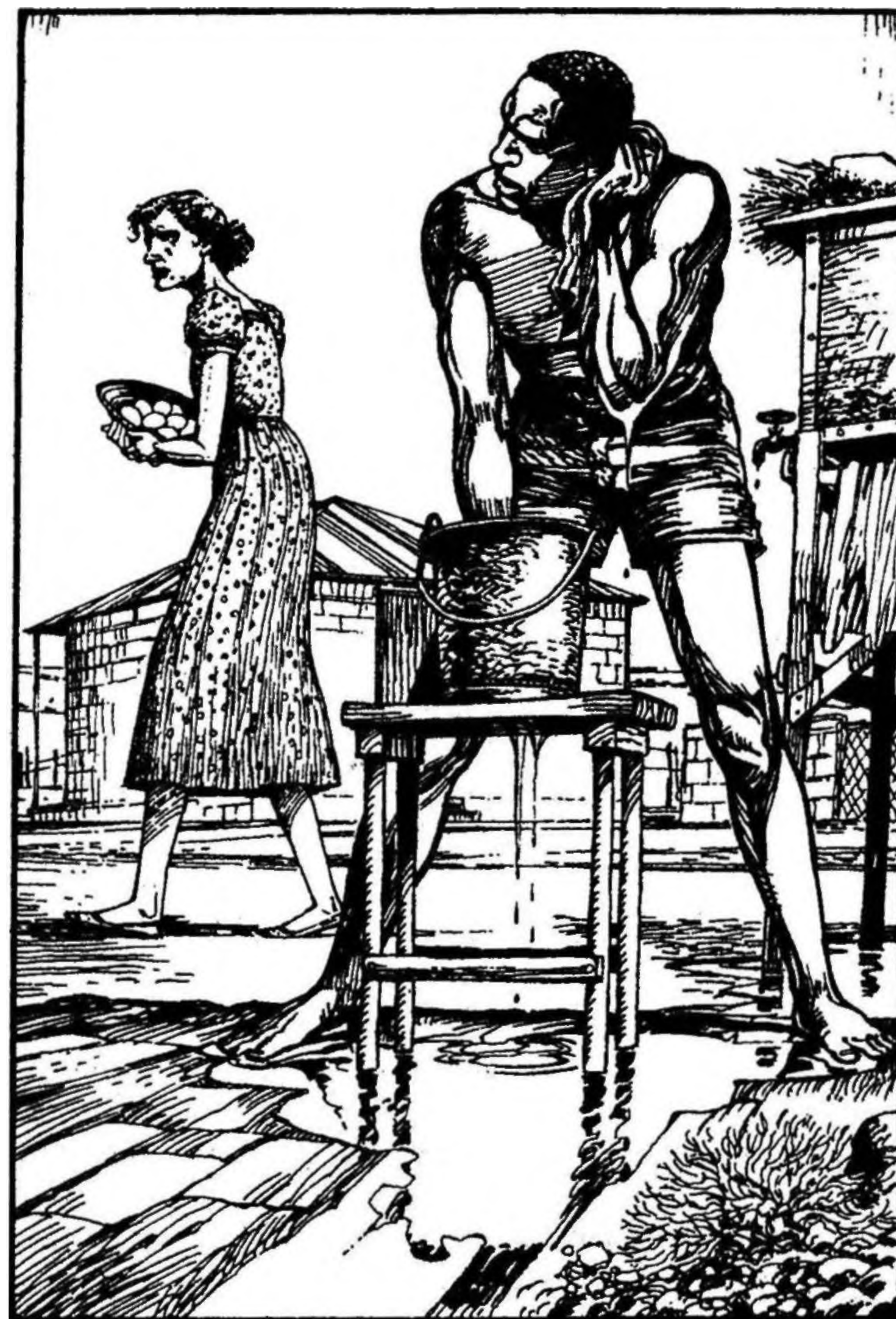
She tried not to be around when the boy had his daily wash. One morning though, she found herself standing a few yards from him.

She tried not to be around when the boy had his daily wash.