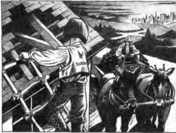
Jude went to the Brown House whenever he could and looked eagerly into the distance.

Jude climbed quickly down the ladder and began to run towards Marygreen, trying not to think about ghosts.