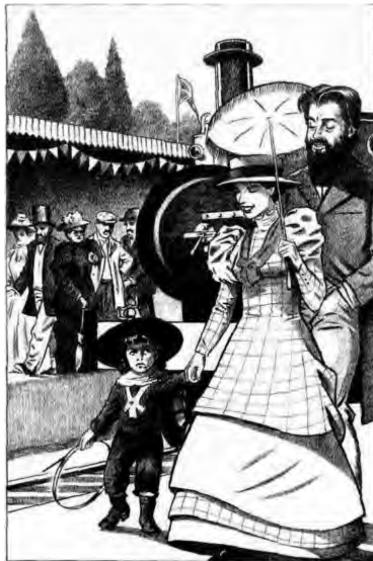
Jude and Sue walked on into the show-ground, enjoying their holiday and trying hard to make Father Time enjoy himself, too.

'Arabella!' She was greeted with a laugh by her girlhood friend Anny, who had come down for the day from Alfredston.