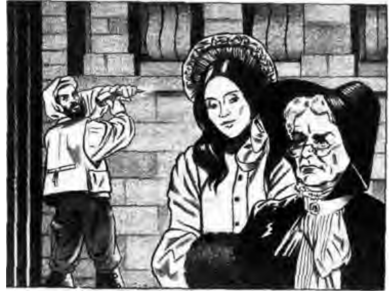
Jude saw Sue next at the 'high' Church of St Silas in Beersheba. She was led by the elderly lady who employed her.

As the days went by, however, he found himself thinking of Sue more instead of less. Indeed, he was always thinking of her.