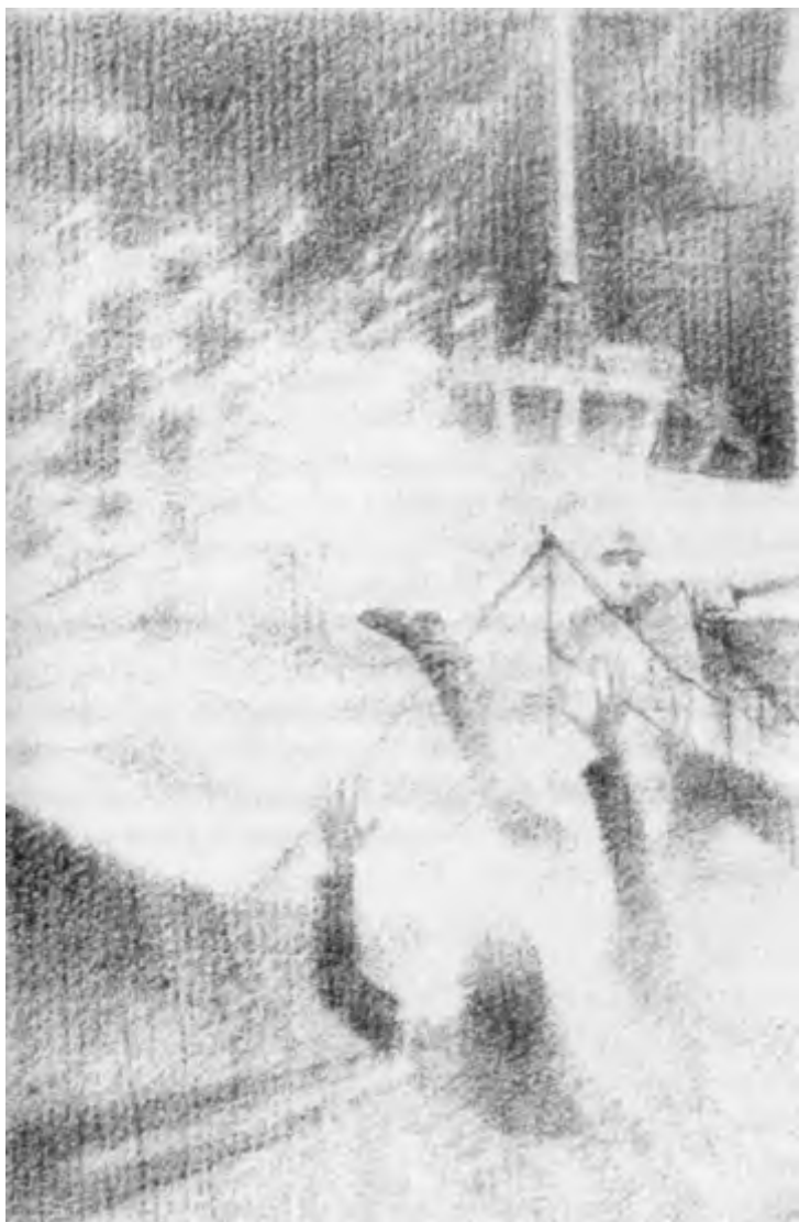
Suddenly a large wave came up and hit the boat hard. The wave covered Bruno and with a scream he fell into the sea.