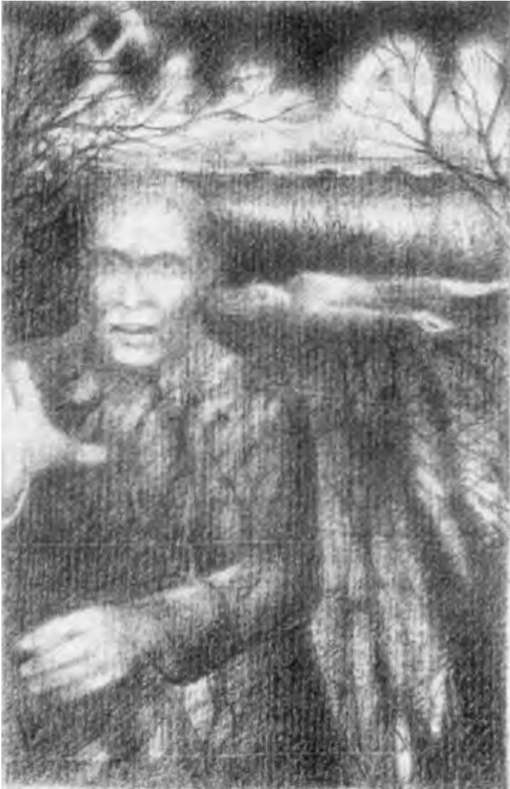
Miriam was silent and Bruno took his hands away. He ran down to his boat and went back over the water to the park.