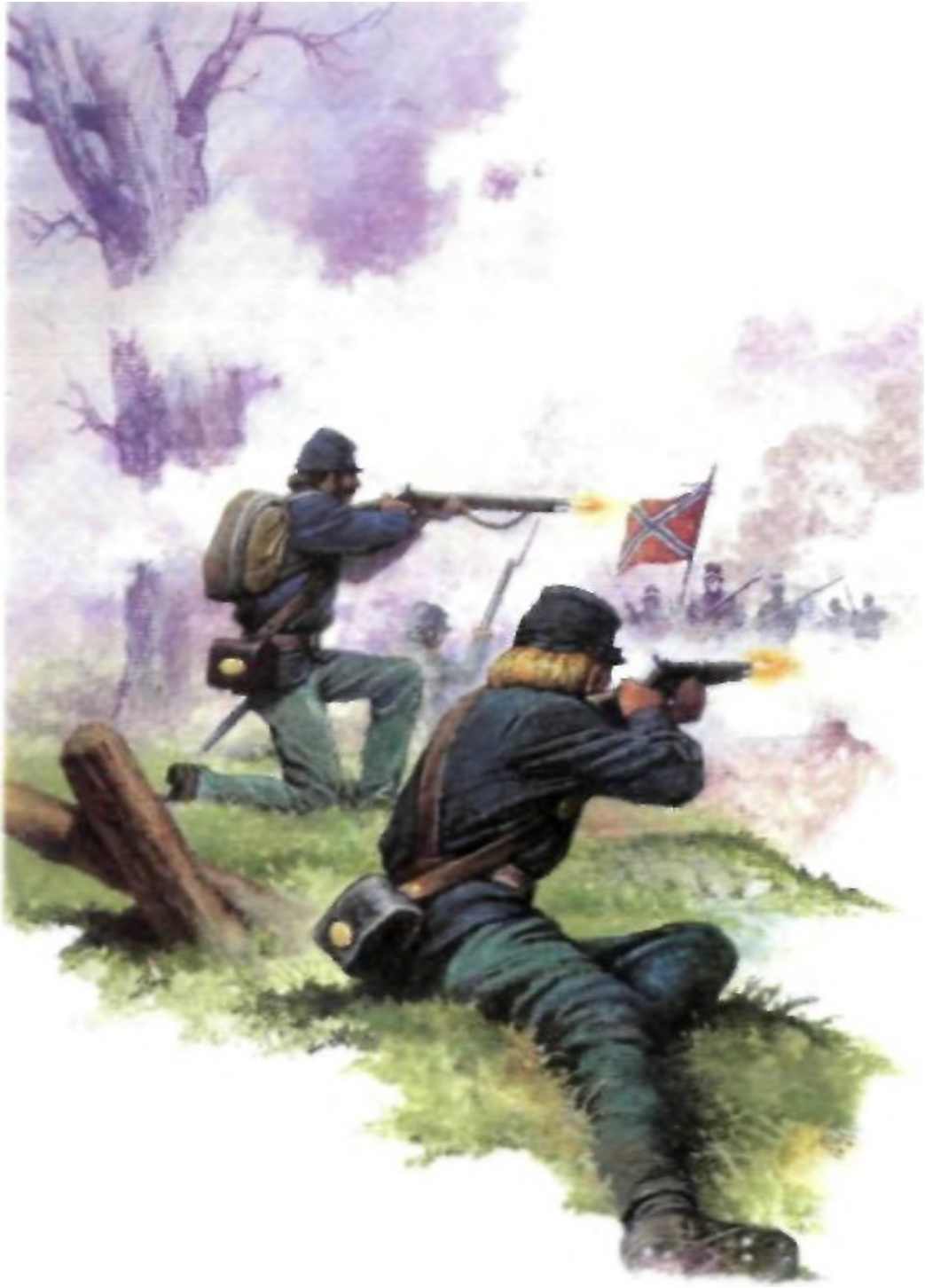
He fought against the enemy soldiers.