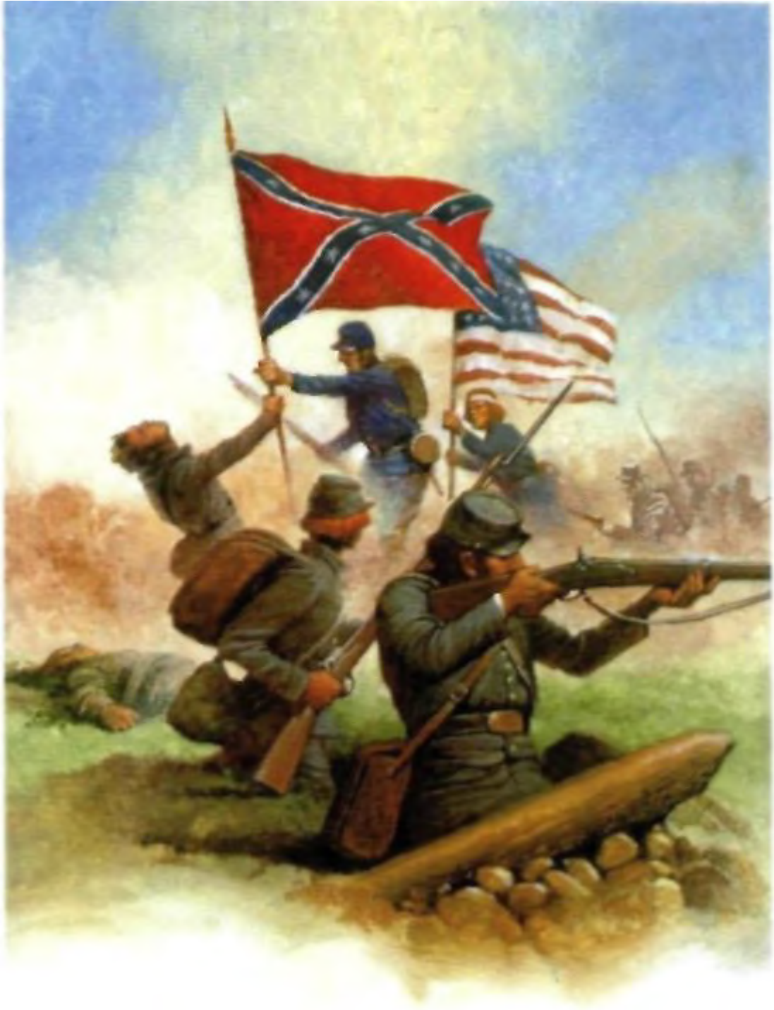
He lifted the flag high above his head.