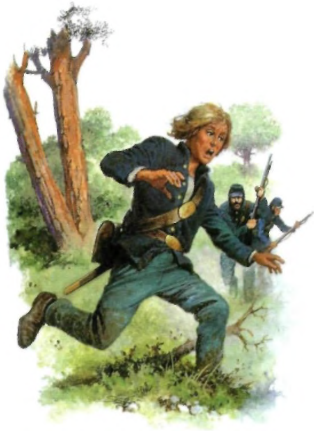
The young soldier run without seeing.