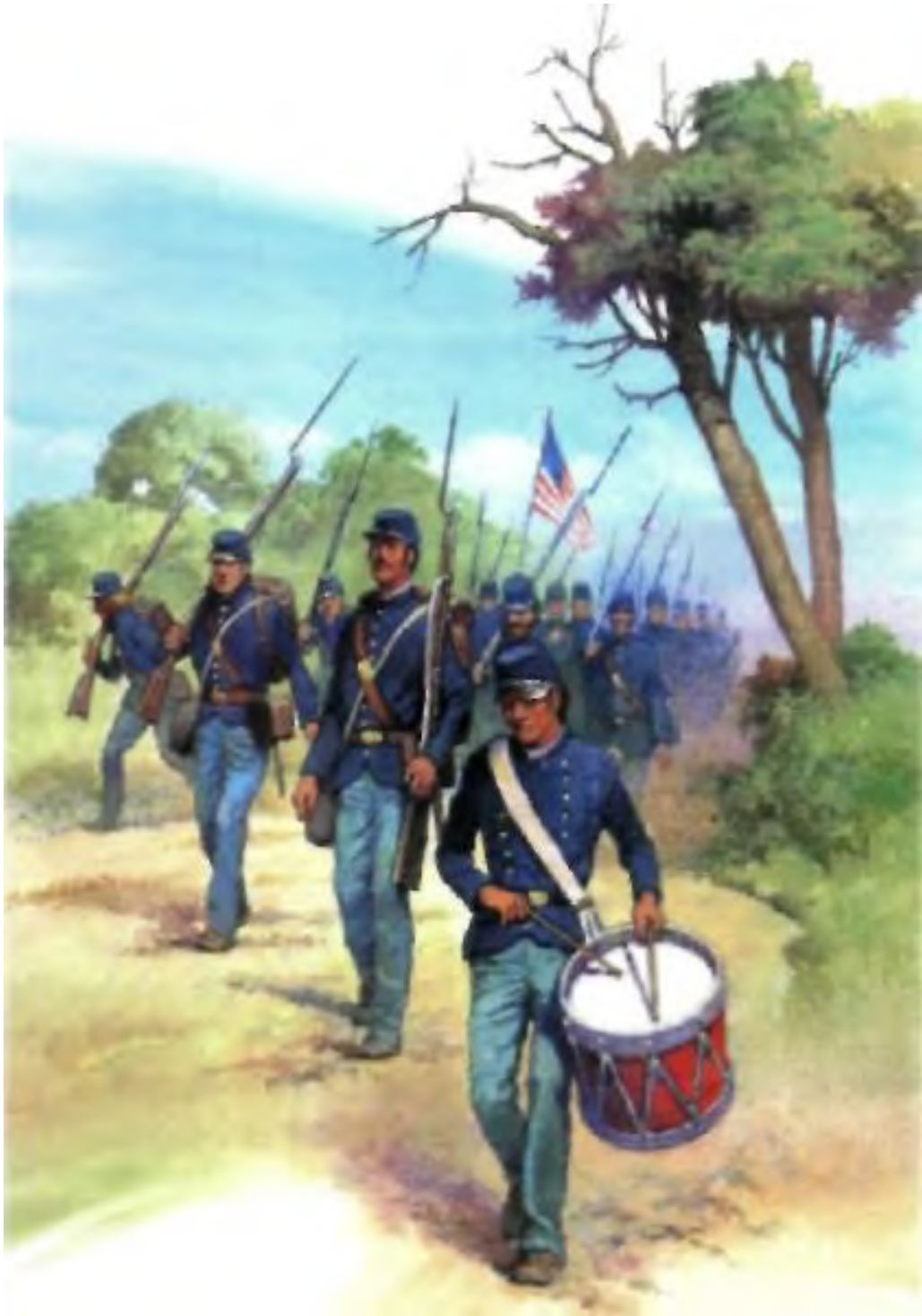
Early the next morning, they followed a narrow road into the forest