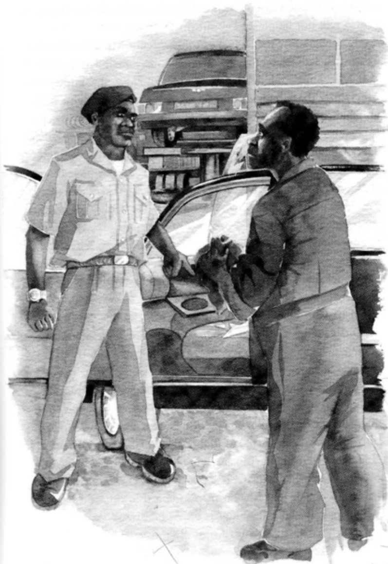
'There is something missing from here.'