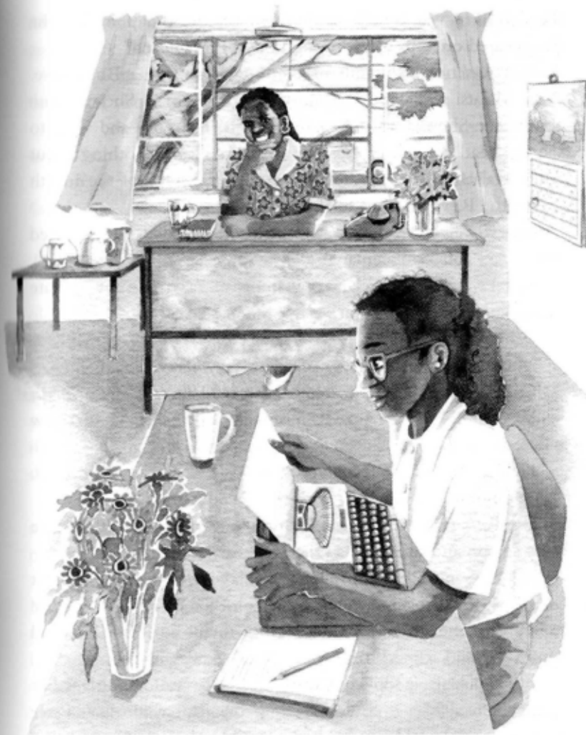
Mma Ramotswe sat at her desk and Mma Makutsi sat at hers.

Mma Malatsi shook her head. 'I don't think so,' she said. 'My husband joined a Christian group a year ago. I don't know who