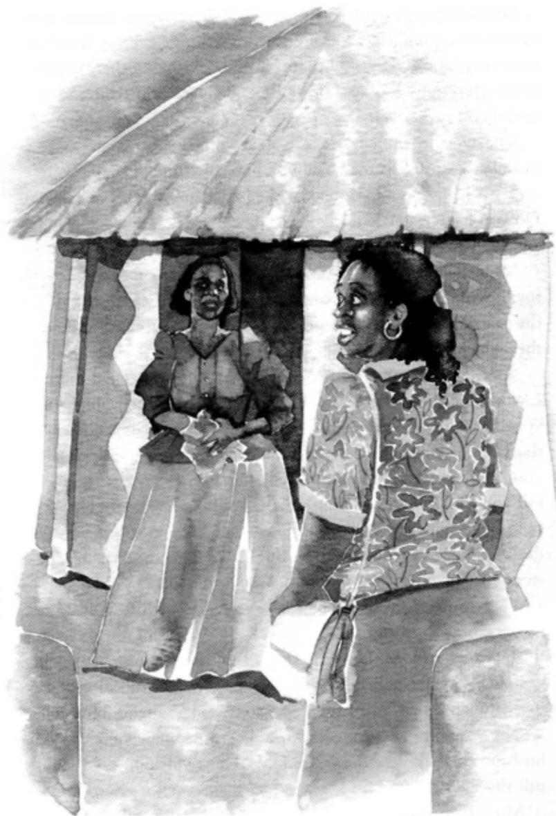
A woman was standing in the doorway.

She turned round again quickly. A woman was standing in the doorway.