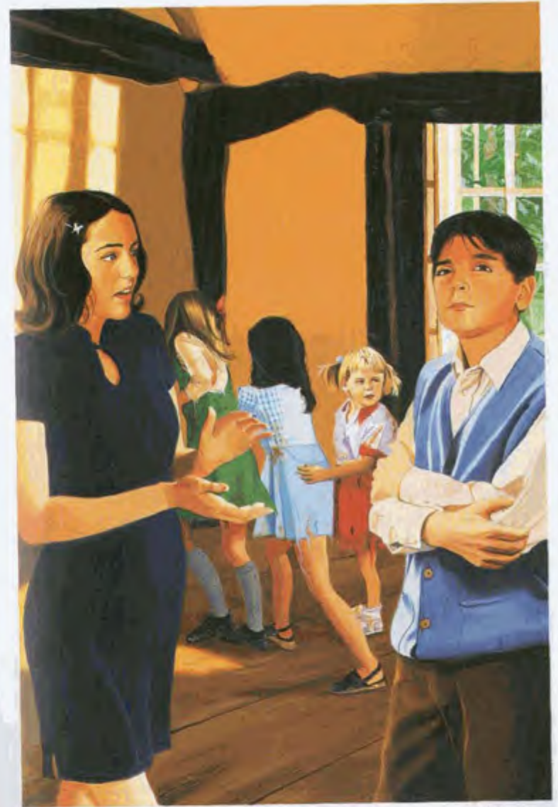
They put their hands round the waist of the child in front until the 'train' is halfway down the room.

'What do you know?' he asks her. 'Did someone tell you something in the village today?'