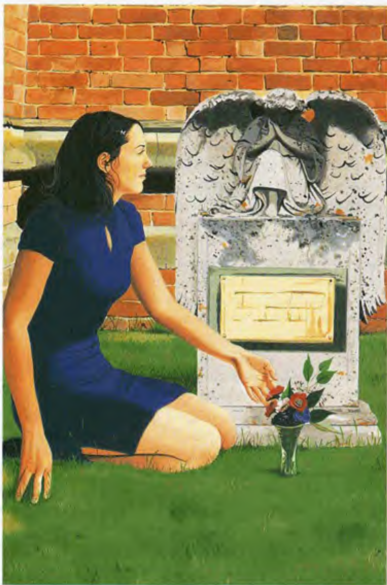
There was writing on the metal plate of the war memorial. Below it were some fresh flowers.

'They were never seen again,' he said. He looked at the spring flowers. 'All this time, but somebody remembers, Elise.' He stopped, but then continued. 'Where were you taken, little children? Dachau, probably. Did I ever tell you, Elise –'