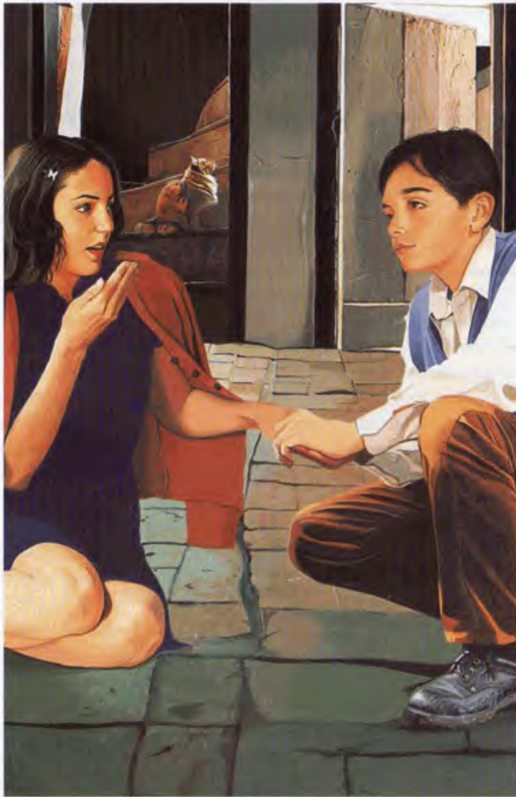
He takes her hand in his hand, and his touch is a help to her.

'They won't want to take me,' she replies.