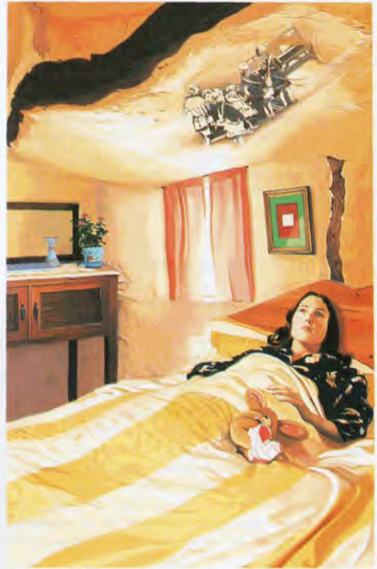
They were carrying packages, and some had bags over their shoulders.

The door below went BANG! as it closed. Elise watched Carol escape with her painting things. 'Is she angry with Dad