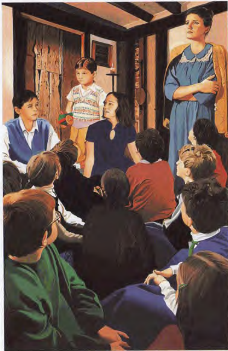
He is angry with her, and not ready to forgive.

that they have taken us to their hearts. And, yes, we are not a secret now.