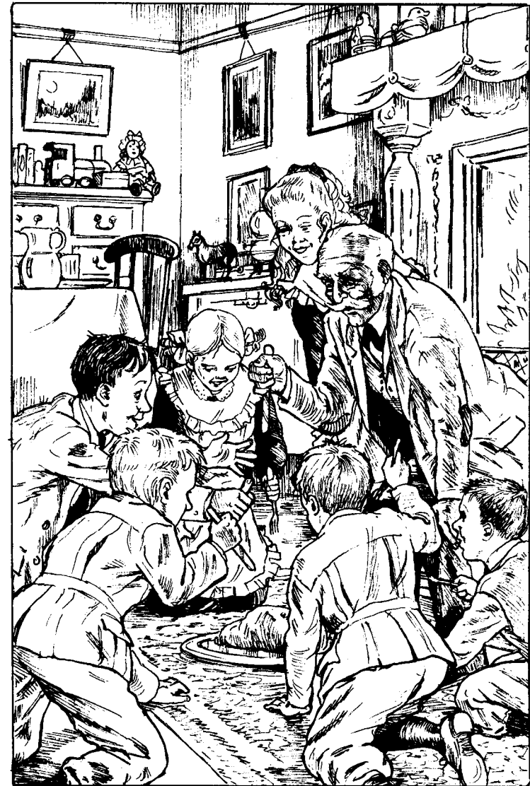
So we all killed the meat with our knives and things.

He smoked a cigar and told us about all the animals in India. We liked him very much.