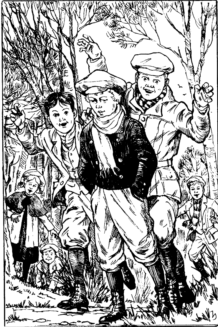
We hid carefully and then jumped out when the walker was close. It was only Albert from the house next to us.

H.O. took the letter to Mrs Morrison. Soon he came back with Albert's uncle.