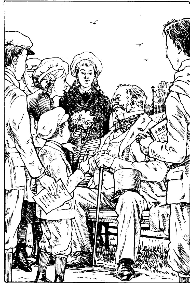
Alice said, 'Please, Lord Tottenham, here are some things for you.'

Lord Tottenham liked the things. 'Thank you very much,' he said.