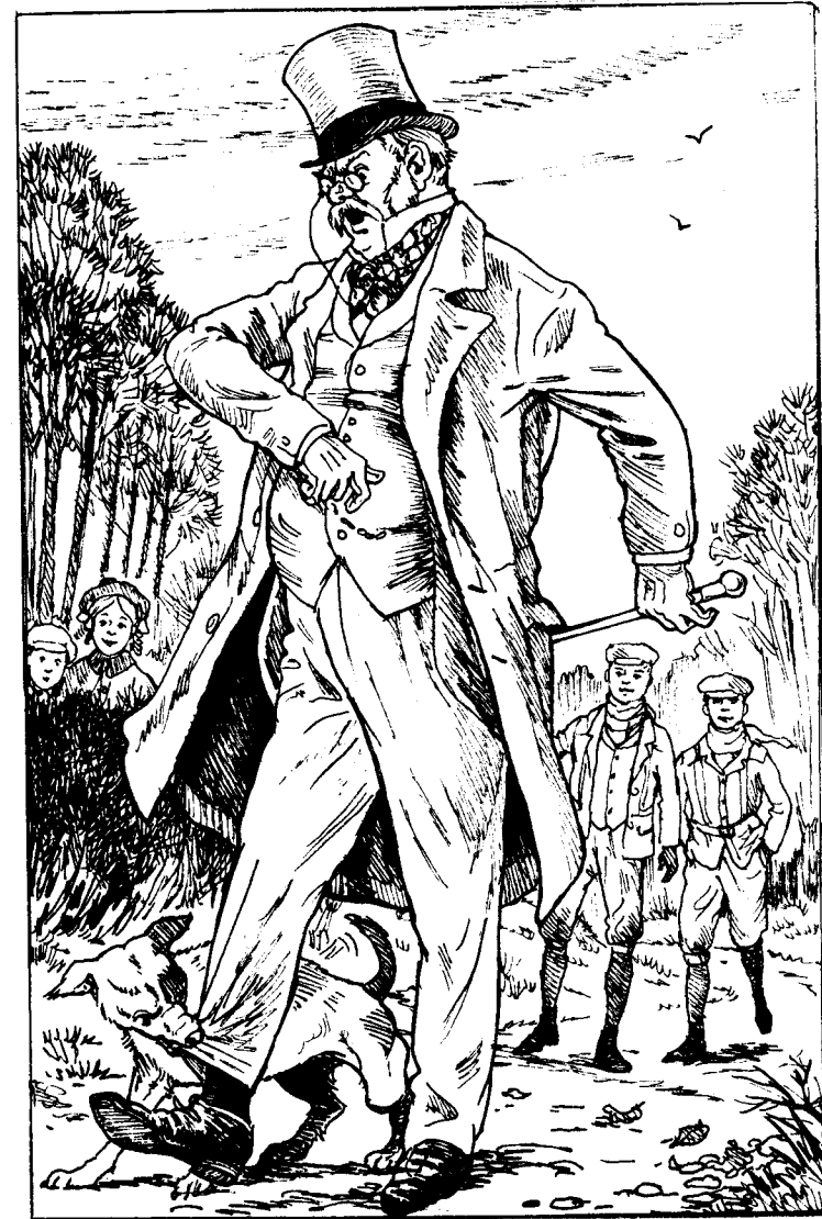
Lord Tottenham jumped up and down. 'Help! Help!' he said.

Lord Tottenham looked at Noel. Noel's face was all white. He stopped walking and we all sat down.