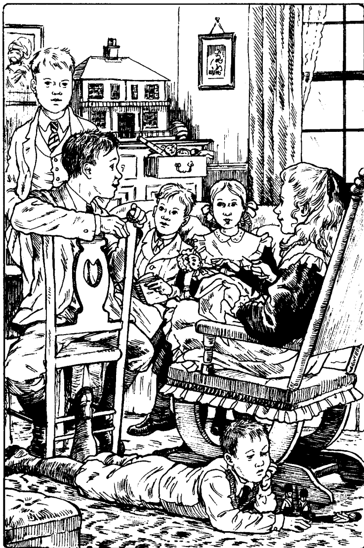
There are six children in our family.

'Noel must find a princess and marry her,' said Alice.