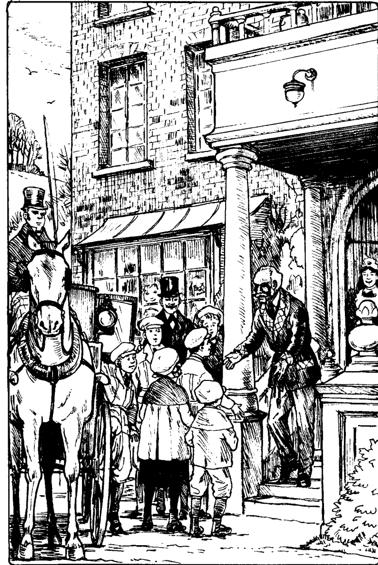
We drove to a very big house near the park. The coaches stopped there.

But no – the house was his. He lived there. He was not a poor Indian; he was very rich. For Christmas he gave each of us a watch.