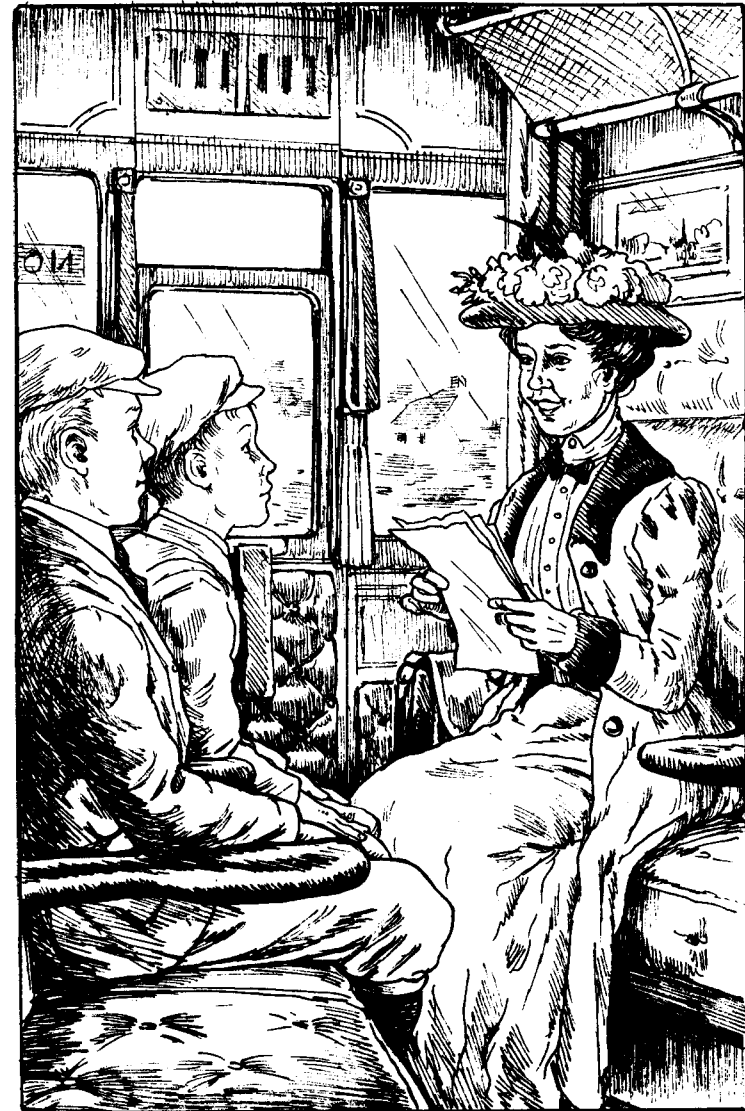
She read Noel's poems. 'I like them a lot,' she said.

The man with the moustache went away again. Soon he came back. 'He'll see you now,' he said. He smiled again.