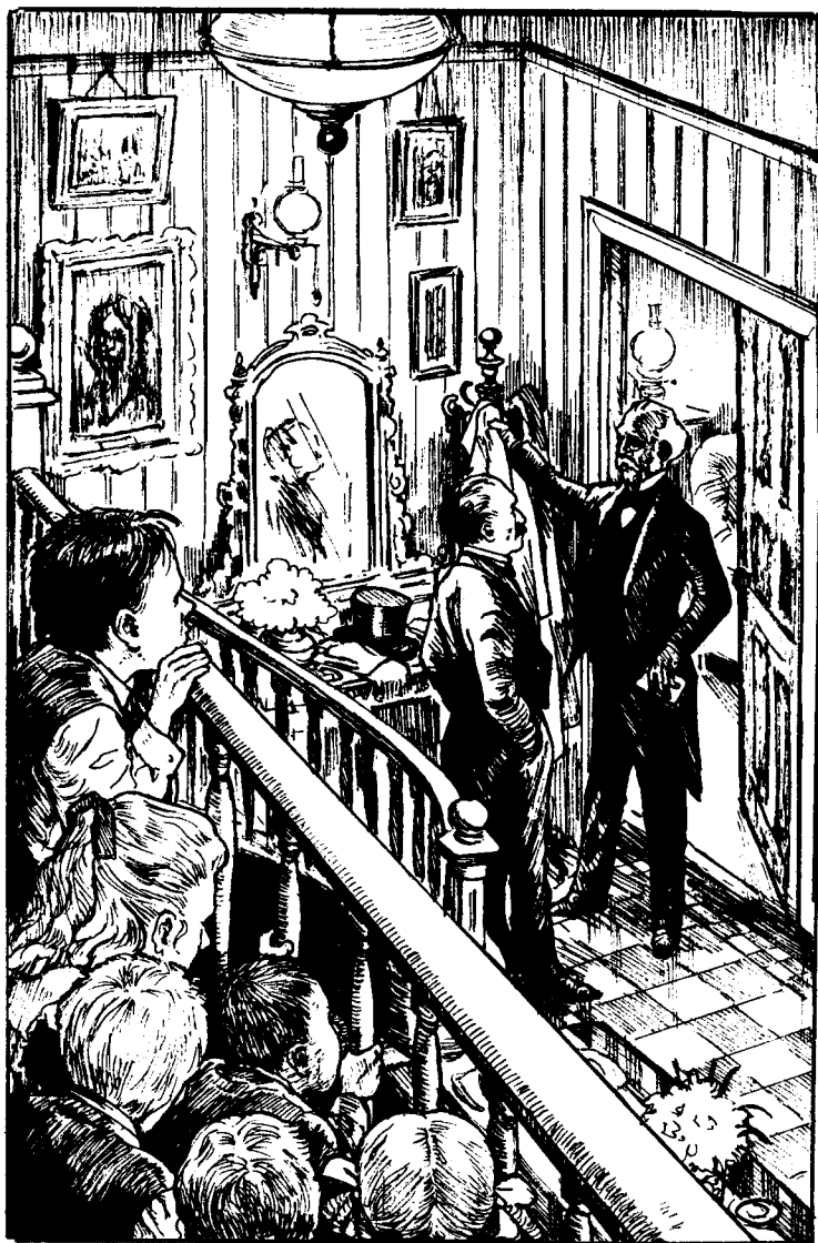
We sat on the floor near our bedrooms and watched.

'I'm sorry that the dinner was bad,' said Dora.