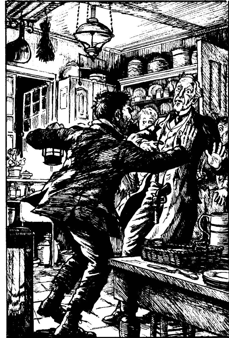
He jumped at our robber and pushed the gun out of his hand.

'Ha! So you're a robber too,' said the poor robber. He jumped at our robber and pushed the gun out of his hand. Then he ran over to the window and climbed out of it, before anybody could do