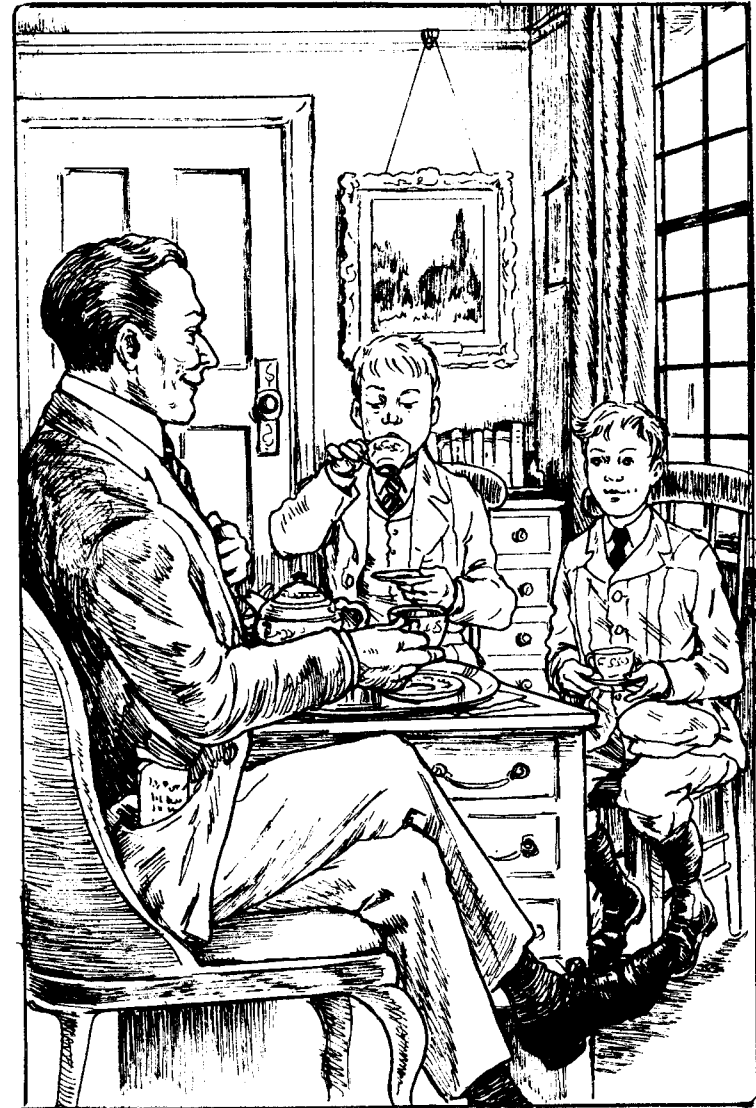
We sat and drank a cup of tea with the newspaper man.

'We often see Lord Tottenham in the park,' I said. 'He talks when there's nobody there. Do you want to put that in your newspaper?'